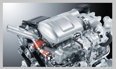
FARMotion engines with electronic 2,000 bar common-rail injection, exhaust recirculation and DOC system.

All imaginable types of farmyard work, light transport applications and field work in moderately sized areas - the new 5D Keyline Series models are simply ideal for smaller and part-time farms. Simply impressive technology: the three-cylinder FARMotion engines with optimised displacement deliver 65 h.p. (48 kW) to 97 h.p. (71 kW) with top performance, fuel efficiency and the best emissions values. Electronic common-rail injection at 2,000 bar, exhaust recirculation, intercooling, DOC exhaust after-treatment, compact radiator with Visco fan and PowerCore air filter – this really is state-of-the-art engine technology. There are two mechanical five-speed shuttle transmissions to choose from: 15+15 or 30+15 gears. Simply efficient: all of these vehicles reach a top speed of 40 km/h at just 1,870 rpm. All 5D Keyline models feature a four-wheel drive system and four-wheel brakes. The four-wheel drive and 100% differential lock have electro-hydraulic controls. Simply versatile: 50 l/min hydraulic pump for up to three mechanically controlled valves in the rear, rear power lift with 3,500 kg lifting capacity and PTO with up to three speeds. Simply comfortable cabin: with 360-degree all-round visibility, wide doors and highly ergonomic operation. The new 5D Keyline Series models are the right choice for anybody wanting to work simply economically.