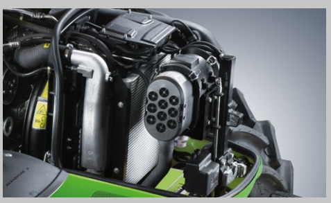
Compact radiator with Visco fan and PowerCore air filter for maximum engine efficiency.