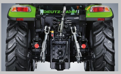
50 l/min hydraulic pump, up to three control valves, 3,500 kg rear power lift, 540/540ECO/1000 PTO.