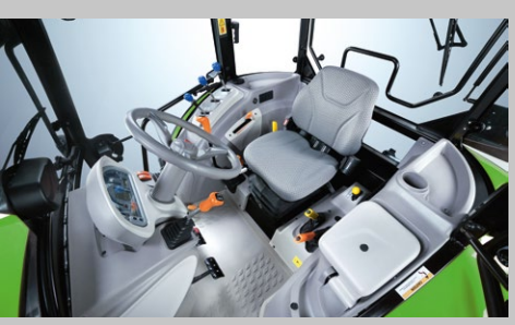
Cabin comfort. 360-degree all-round visibility, highly ergonomic operation and choice of two roof options.