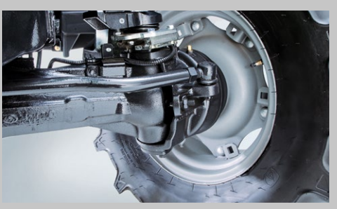
Electronically activated four-wheel drive and 100% differential lock, four-wheel brake and 55-degree steering angle.