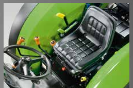
A comfortable driver zone with side controls at your fingertips.

DEUTZ-FAHR AGROPLUS F ECOLINE 310-315-320-405-410-420